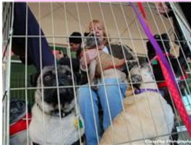
Doggy Spa Fundraiser