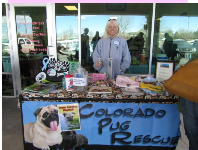
Doggy Spa Fundraiser